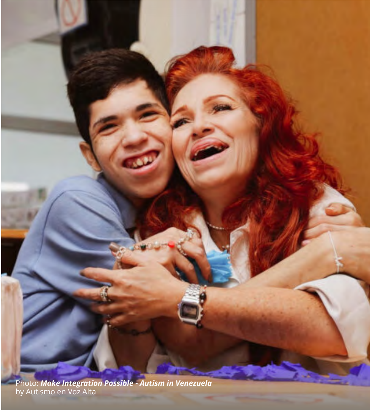
Photo: Make Integration Possible - Autism in Venezuela by Autismo en Voz Alta

Thank you for believing in the power of community-led change.