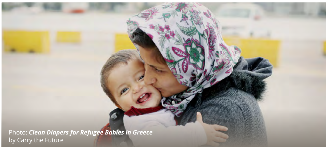
Photo: Clean Diapers for Refugee Babies in Greece by Carry the Future