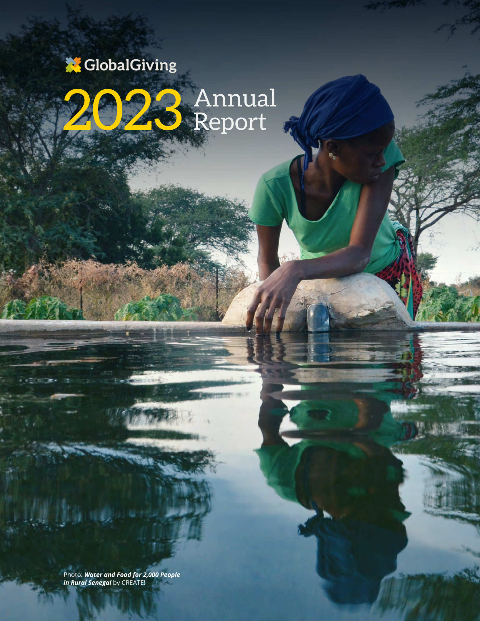
Photo: Water and Food for 2,000 People in Rural Senegal by CREATE!