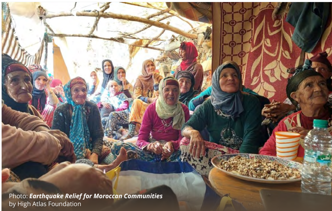
Photo: Earthquake Relief for Moroccan Communities by High Atlas Foundation